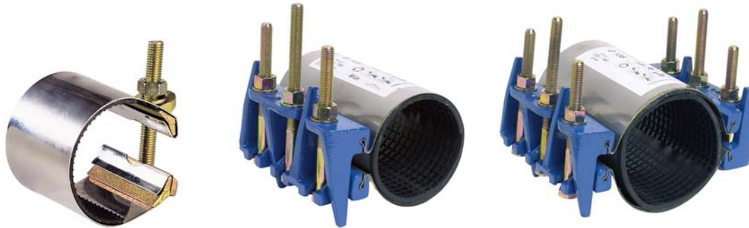
Ref. 1401 Type M 1 bolt Length 80mm